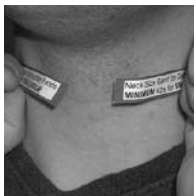
Neck size is okay for respirator size

3. The ends of the band must not touch or overlap. If the ends of the band touch or overlap, then the neck seal opening for that respirator is too large and will not provide an adequate seal.