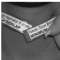
Neck size is too small for respirator size